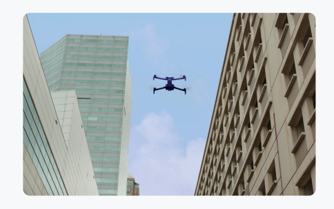
Operate in dense urban canyons.