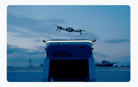
Get your drone home safe, day or night.